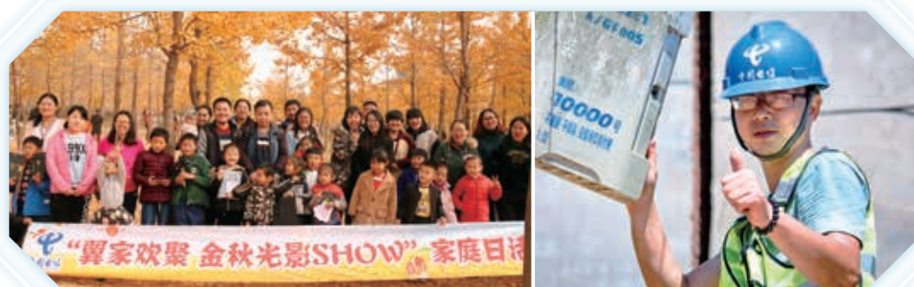
Caring for employees through various measures to stimulate employees’ vitality

The Company strictly complies with and implements the relevant laws and regulations regarding labour and protection of the employees’ rights and interests including the Labour Law of the People’s Republic of China , the Labour Contract Law of the People’s Republic of China and the Trade Union Law of the People’s Republic of China , and protects the rights and interests of employees with respect to labour rights, democracy rights and spiritual culture rights in accordance with the laws. The Company strictly implements the Notice on Standardisation of Labour Management in Strict Compliance with the Labour Contract Law of the People’s Republic of China , improves labour management, and conducts workforce employment in accordance with laws and regulations. The Company also ensures that all contract employees have their labour contracts