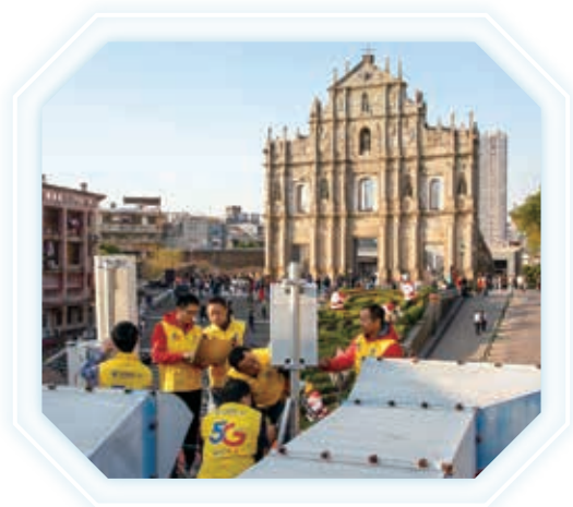
Telecommunication assurance for the 20th anniversary of Macau handover

The Company is truly committed to the mission of providing safe and smooth communications assurance and is devoted to fight against a number of severe natural disasters such as earthquakes, typhoons, floods and landslides and to safeguard important events. In 2019, we successfully accomplished disaster relief and emergency telecommunications assurance for the forest fire in Liangshan Prefecture of Sichuan Province and Changzhi of Shanxi Province, the earthquake of 6.0 magnitude in Changning of Sichuan Province, the super typhoon named Lekima and the mudslide caused by torrential rain in