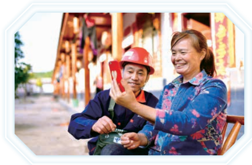
Facilitated communications services in remote areas

regions, municipalities), benefiting more than 39 million registered population living in poverty. The Company fully supported the construction of information platform in relation to the “Learning Mandarin at Preschools Stage” initiative of the State Council Leading Group Office of Poverty Alleviation and Development. The pilot project in Liangshan Yi Autonomous Prefecture in Sichuan Province was awarded the 2019 National Poverty Alleviation Organisation and Innovation Award . We continued to support information system for poverty alleviation developed by the State Council Leading Group Office of Poverty Alleviation and Development and provided technical support to China Social Poverty Alleviation Websites to help the development of poverty alleviation activities. The Company continually promotes farmer cooperatives and assists the economy development in rural areas based on their actual needs.