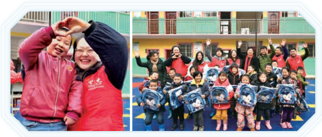
Young volunteers of Jiangxi Telecom participated in social service to care for left-behind children and elders

in natural conditions in these areas. The Company fully cooperated with the parent company to assign the cadre team to carry out poverty alleviation work in the 6 counties. The Company conducted poverty alleviation through projects focusing on network, informatisation, industry, employment, intelligence, social welfare and consumption in order to improve the living conditions in these areas, develop the economy and help local residents to alleviate poverty and increase income. During the year, the Company assisted in introducing more than RMB70 million worth of industrial investment, trained more than 6,000 grass-root cadres and technicians and directly purchased and helped to sell agricultural and sideline products amounting to nearly RMB100 million in poverty-stricken counties, achieving remarkable success in poverty alleviation. In addition, in 132 counties and 1,204 villages in some other provinces (autonomous regions and municipalities), the Company also cooperated with the parent company to assign full-time and part-time poverty alleviation cadres to thoroughly implement measures for poverty alleviation to help local people to combat and overcome poverty.